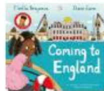
Coming to England