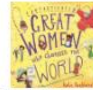
Fantastically Great Women who Changed the World