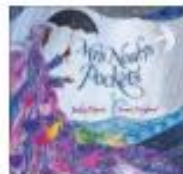
Mrs. Noah's Pockets