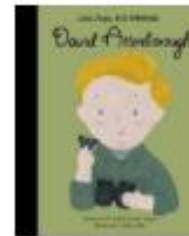
Little People Big Dreams - David Attenborough