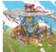
The Quangle Wangle's Hat