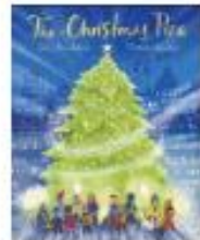
The Christmas Pine