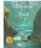
Rhythm of the Rain