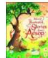
Aesop's Fables - The Sun and the Wind