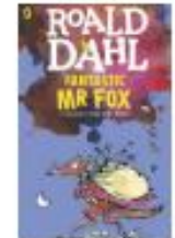
Fantastic Mr. Fox