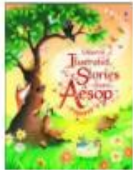
The Goose That Laid the Golden Egg