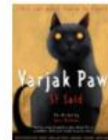
Varjak Paw Block 12