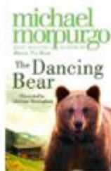
The Dancing Bear Block 15