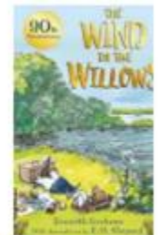
The Wind in the Willows