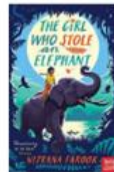
The Girl Who Stole the Elephant Block 6